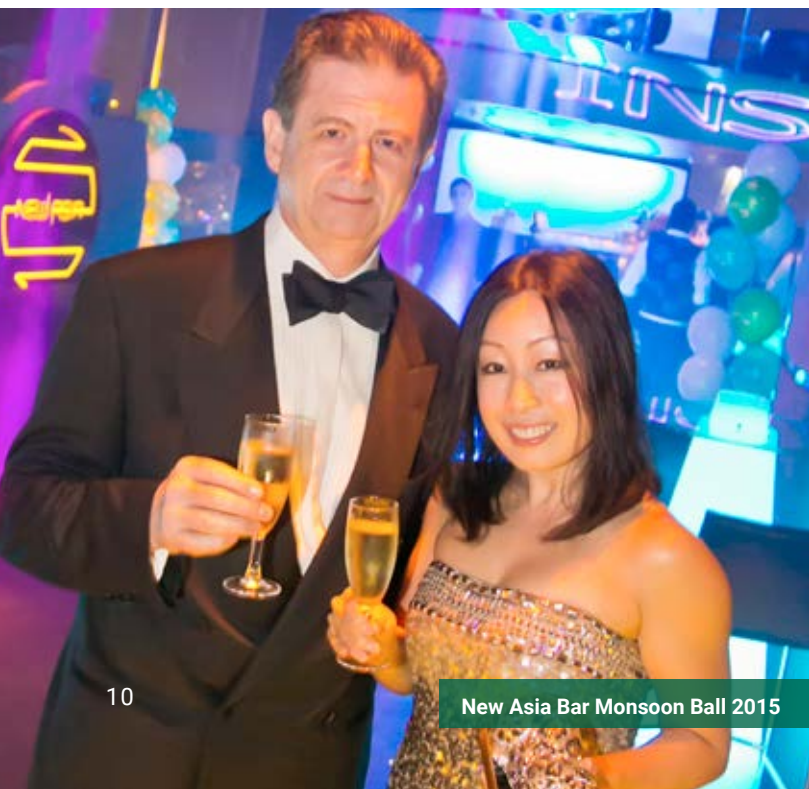
New Asia Bar Monsoon Ball 2015