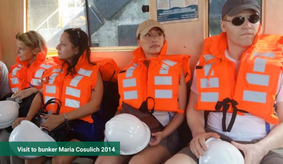
Visit to bunker Maria Cosulich 2014