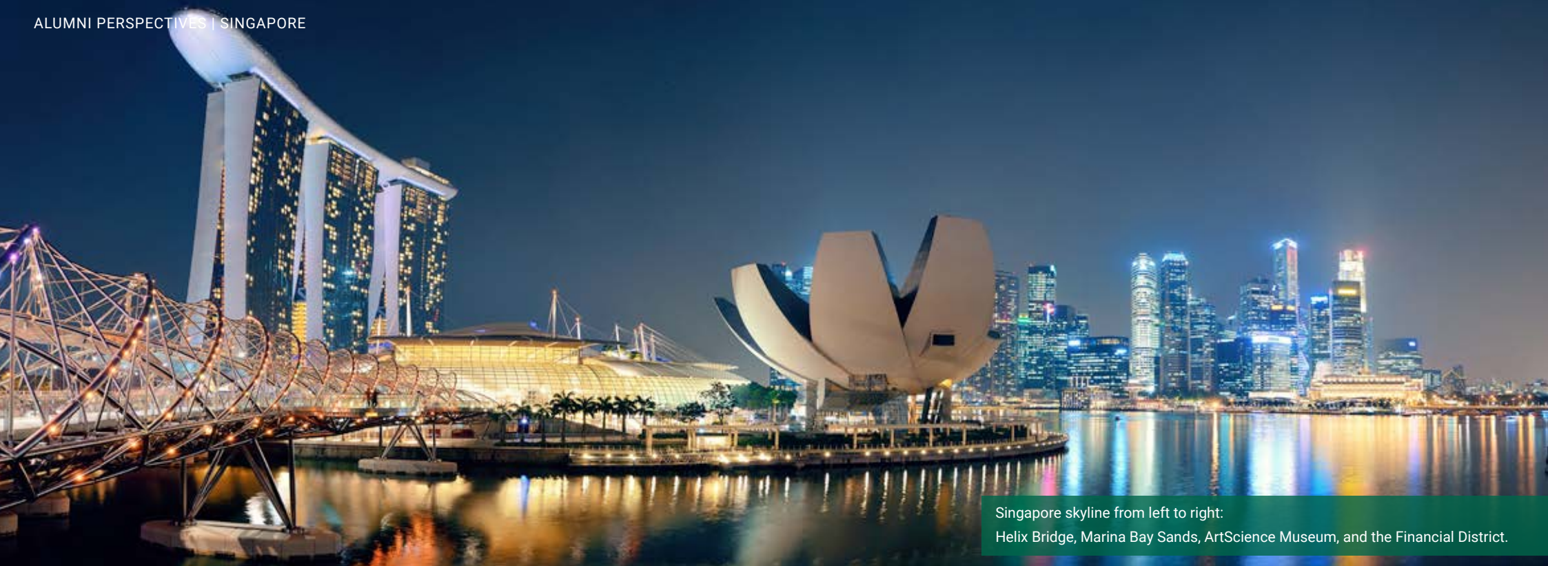
Singapore skyline from left to right: Helix Bridge, Marina Bay Sands, ArtScience Museum, and the Financial District.