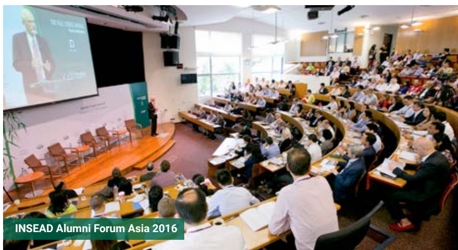
INSEAD Alumni Forum Asia 2016