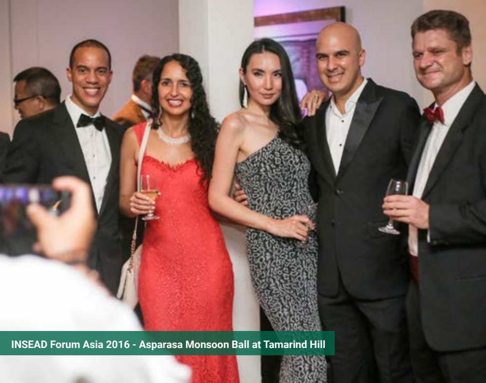
INSEAD Forum Asia 2016 - Asparasa Monsoon Ball at Tamarind Hill