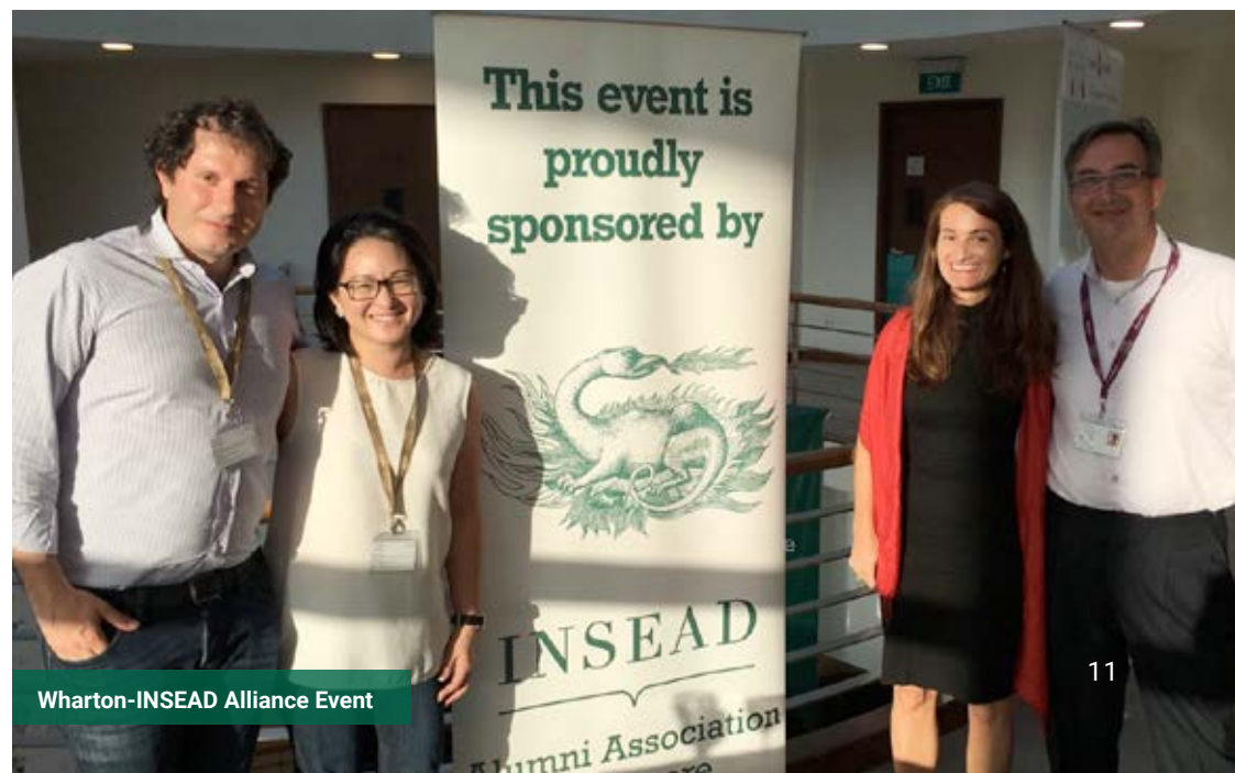
Wharton-INSEAD Alliance Event