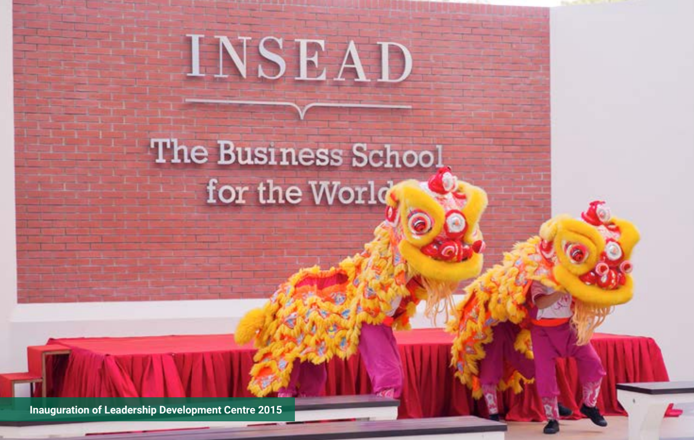
Inauguration of Leadership Development Centre 2015