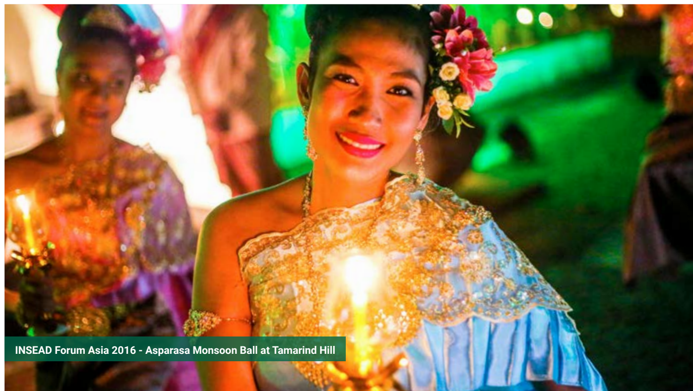
INSEAD Forum Asia 2016 - Asparasa Monsoon Ball at Tamarind Hill