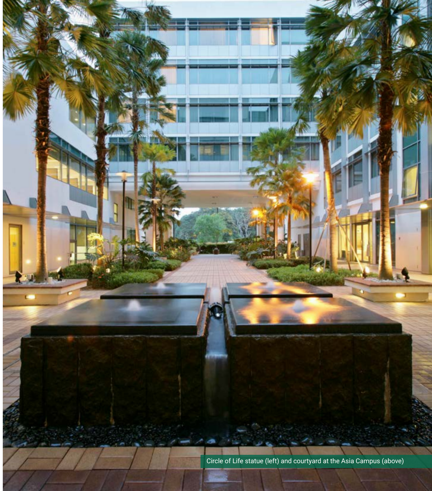
Circle of Life statue (left) and courtyard at the Asia Campus (above)