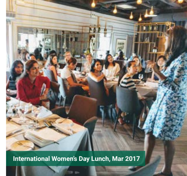
International Women's Day Lunch, Mar 2017