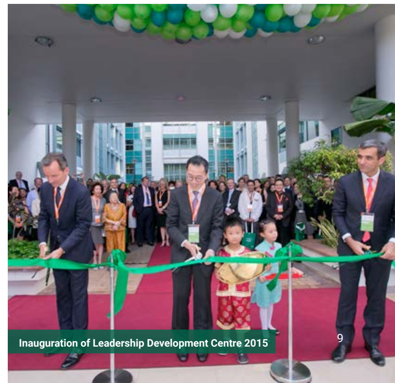
Inauguration of Leadership Development Centre 2015