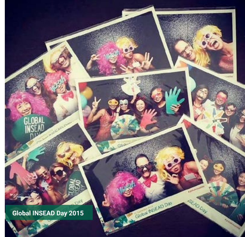
Global INSEAD Day 2015