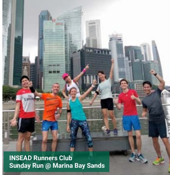
INSEAD Runners Club Sunday Run @ Marina Bay Sands