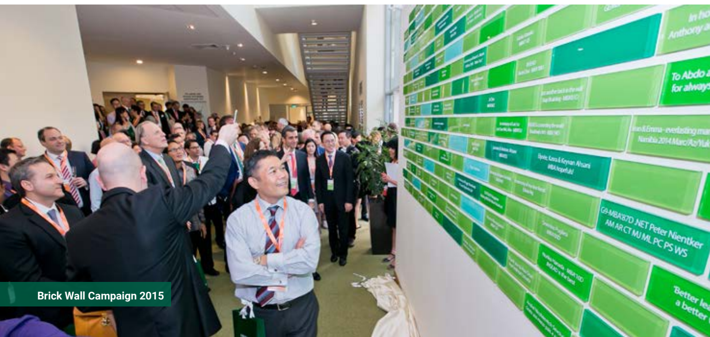
Brick Wall Campaign 2015