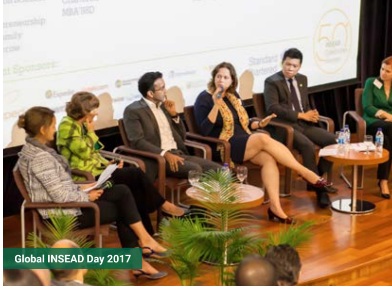
Global INSEAD Day 2017