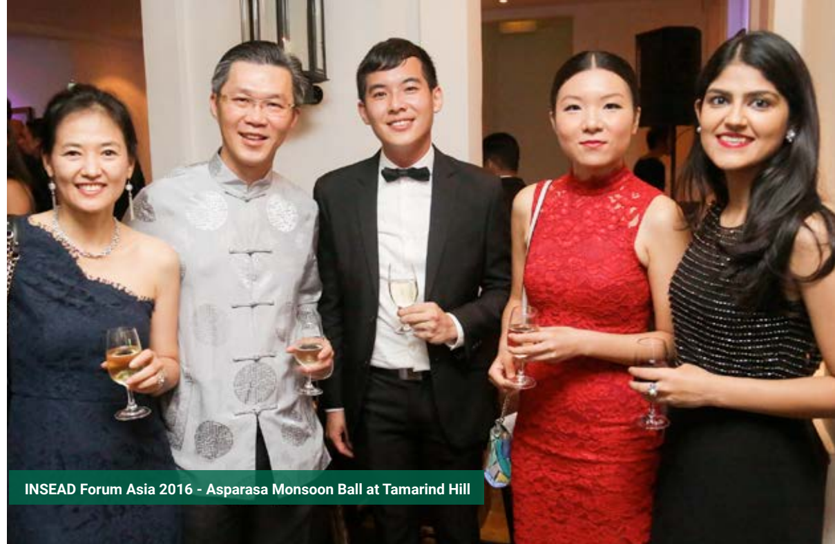
INSEAD Forum Asia 2016 - Asparasa Monsoon Ball at Tamarind Hill