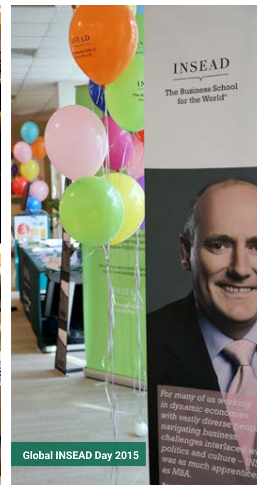
Global INSEAD Day 2015