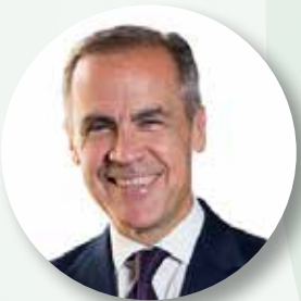
Mark Carney UN Special Envoy for Climate Action and Finance