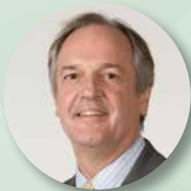
Paul Polman CEO Imagine